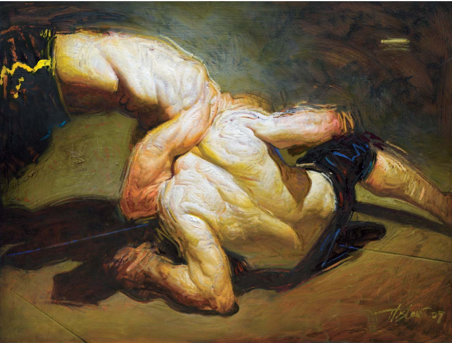
HEADLOCK, OIL ON PANEL, 36 x 48"