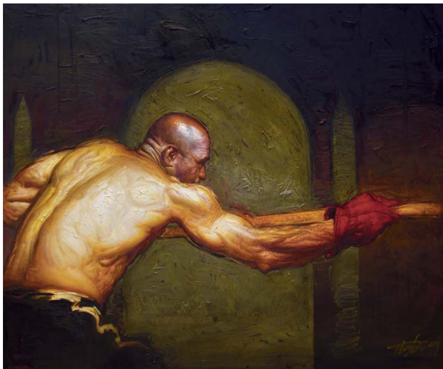
TAUT, OIL ON CANVAS, 60 X 72"

In the piece titled Headlock , Huston intentionally keeps the backdrop vague,